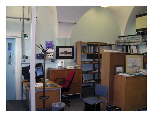
A small part of the paper archives

The additional rooms on the lower ground floor house a history of word processing, from the typewriter to the DisplayWriter, and Personal Computing. We already have working models of the IBM-PC, PC-XT, PC Portable (aka Luggable!) and a PS/2 ready for display, with some old PC games to run on them. We also hope to receive in the near future an original data processing installation, consisting principally of an IBM 702, from the Army Pay Corps, Worthy Down.