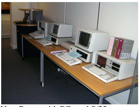
New Room with PCs and S/23

The additional rooms on the lower ground floor house a history of word processing, from the typewriter to the DisplayWriter, and Personal Computing. We already have working models of the IBM-PC, PC-XT, PC Portable (aka Luggable!) and a PS/2 ready for display, with some old PC games to run on them. We also hope to receive in the near future an original data processing installation, consisting principally of an IBM 702, from the Army Pay Corps, Worthy Down.